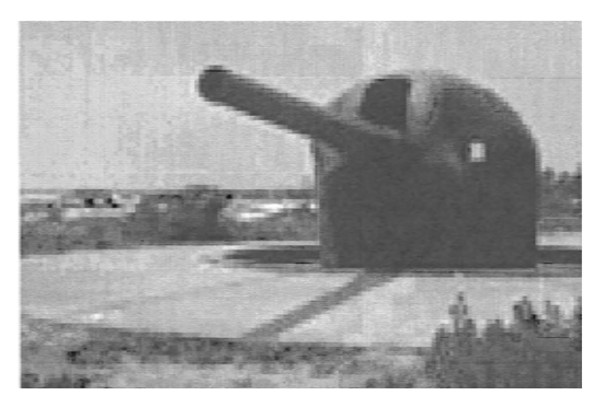
Fig. 7.2: Photograph of a 6-inch gun, thought to be at Milagra Ridge.

covering land all the way up to the fences of the launch site. The furrows from this farming activity still exist. It is recommended that further research be undertaken to find out who the farmers were, what kind of relationship they had with the Army and when this artichoke growing began and when it ended.